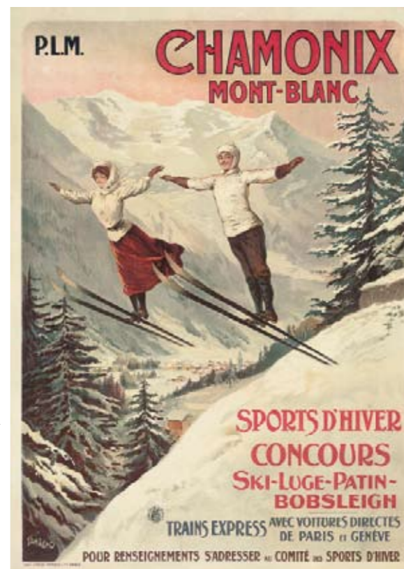
Above Megève by Kama, lithograph in colours, c1935, estimate £1,200-£1,400 Left Chamonix Mont-Blanc by Francisco Tamagno (b1851), lithograph in colours, c1900, estimate £10,000-£15,000