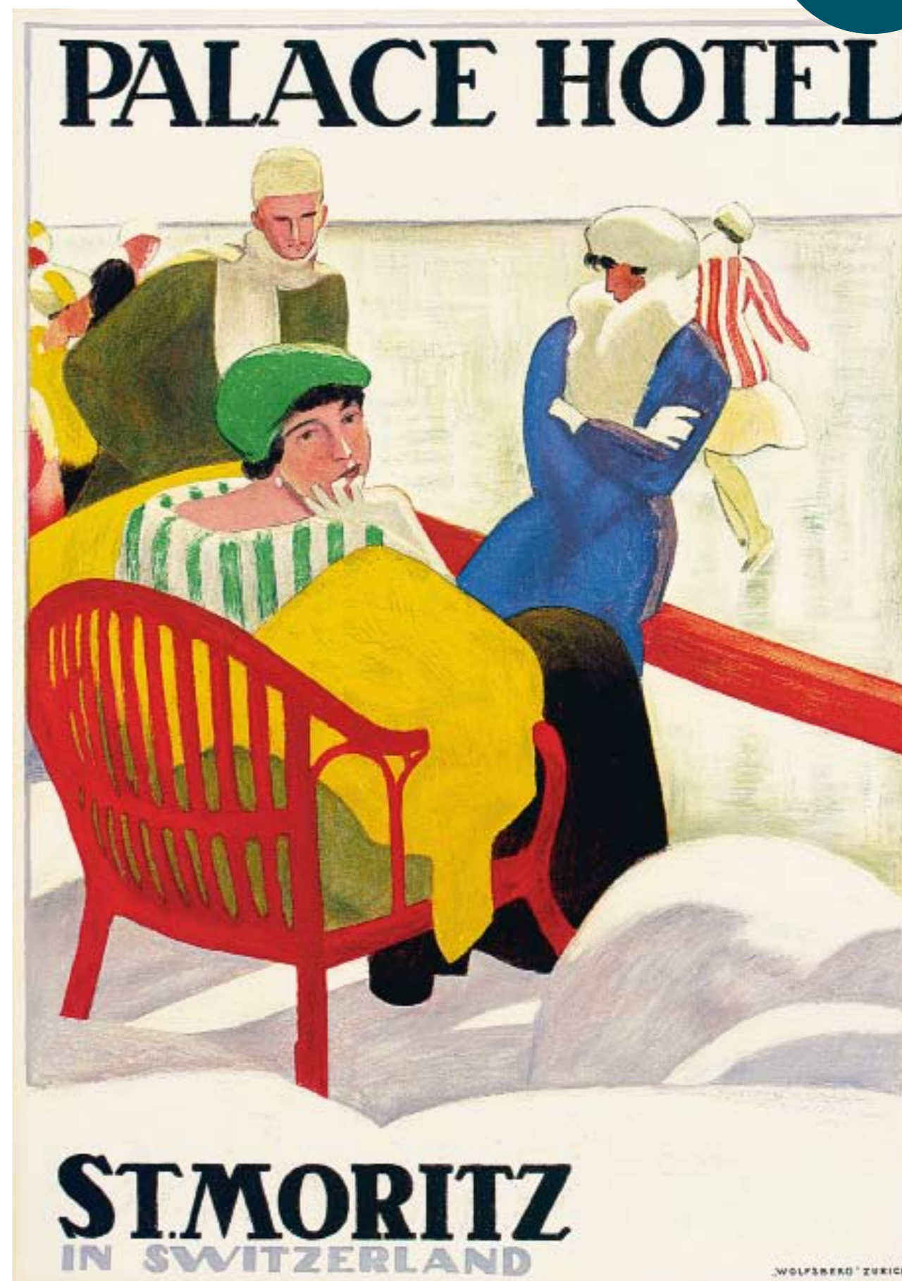
ORIGINAL SKI POSTERS

Interestingly, it's not the artist that's key here – you could find a late 1920s Cardinaux poster for around £2,000. The interest comes through the graphics and the subject matter. As an aside, those who can afford to ski in St Moritz today make very good bidders at auction, which adds to its value!